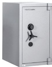
Mini Banker Size 6