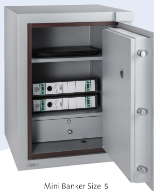
Mini Banker Size 5