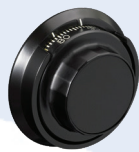
Keyless Combination Lock