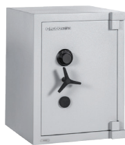
Mini Banker Size 5