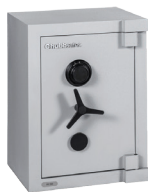
Mini Banker Size 3