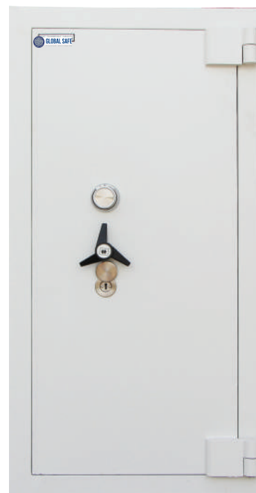
SS-65 : SIZE ONE [1]