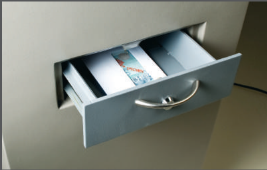
Loading deposit drawer

No need for key or combinations to be given or disclosed to junior staff. The TRAPMASTER SAFE 2240 and SAFE 2250 provides maximum protection for your cash collections, even when the authorised executive holding the key, is not on duty.