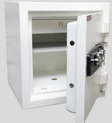
Model : SS - 35