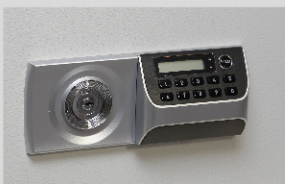
6 digit digital lock and key lock