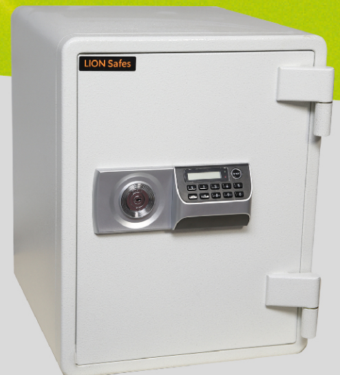
Model : 31 - OK