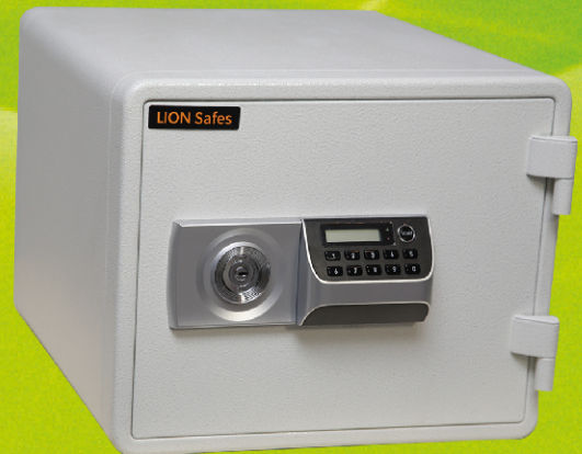
Model : 20 - OK

FIRE-RESISTANT SAFES PERFECT FOR HOME AND/OR BUSINESS USE THAT OFFER SUPERIOR FIRE PROTECTION FOR YOUR VALUABLES AND IMPORTANT DOCUMENTS.