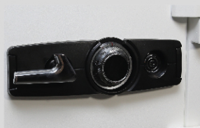
3 wheel combination lock (Changeable to digital lock) and key lock