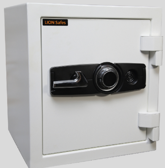
Model : SS - 35