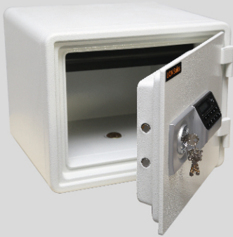
Model : 20 - OK